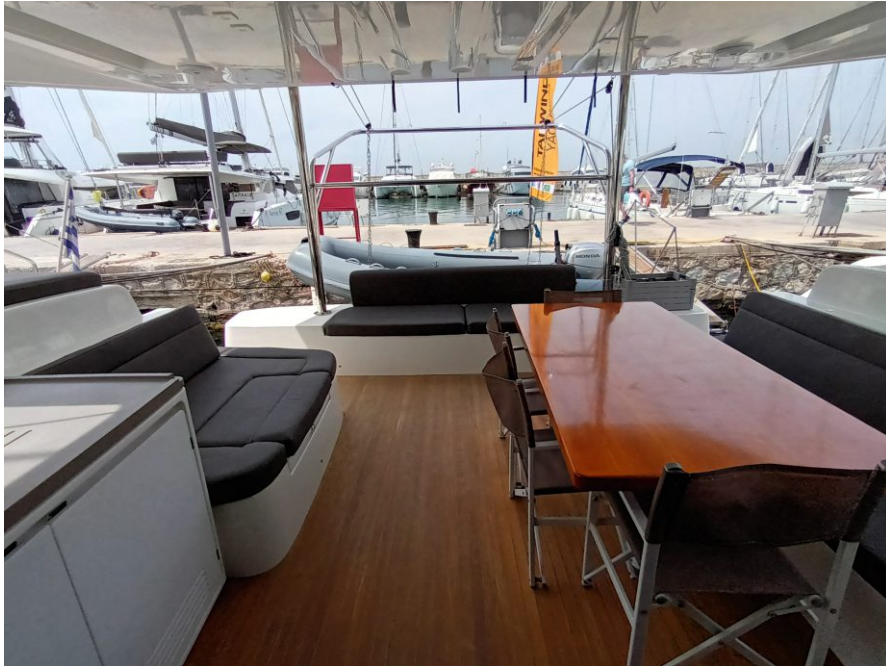
Teak deck with large wooden table